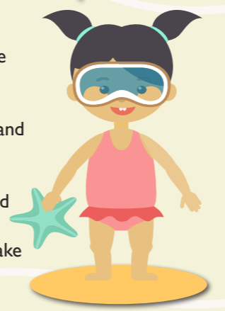
Figure out what I want to say, and put it into words for me.